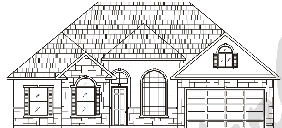
FRONT ELEVATION OPTION 2